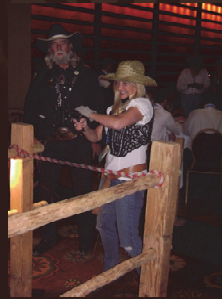
Lot's of fun