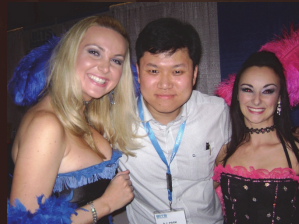
And a way to get abstract commitments